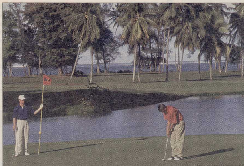
Hyatt Dorado Beach course in Puerto Rico.