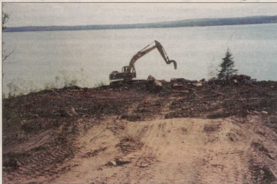
Algonquin Golf Club's 12th hole will be one of several with views of the Atlantic Ocean.

The ocean will be visible from almost every spot on the course. The signature hole may eventually be the par-3, 12th, which drops approximately 75 feet from