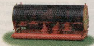
Verti-Drain Greens Model 7316, just one of nearly a dozen models available to fit virtually every budget.

To really see the dynamic action of the Verti-Drain phone now for our information packet including our new, free video.