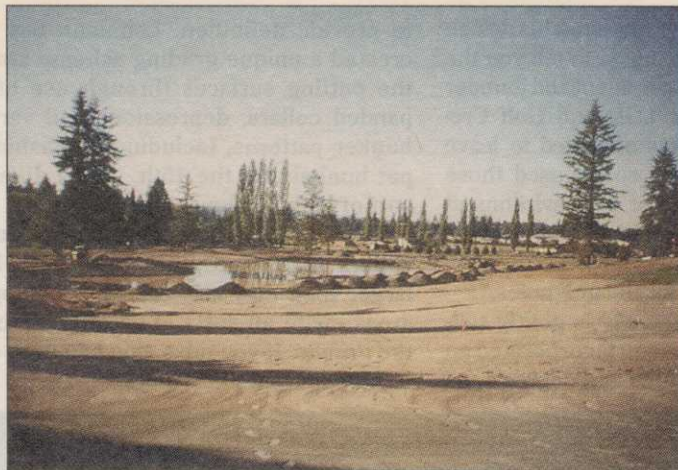
As shown on Cedarcrest Golf Course's 12th hole above, once the sod is stripped off the fairways, 4 inches of sand is laid atop new drainage tiles. At right is Cedarcrest's 3rd hole after construction.