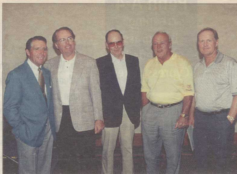
Maybe a first: Gary Player, Tom Fazio, Pete Dye, Arnold Palmer and Jack Nicklaus all in one room at the same time for the project announcement in Palm Beach Gardens.