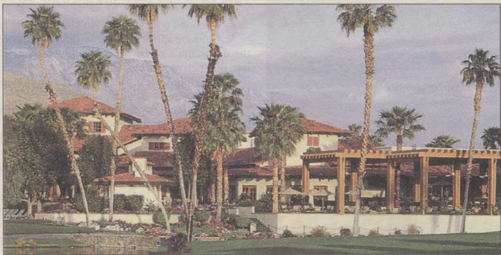
The main hotel at Rancho Las Palmas Marriott Resort in Palm Springs.