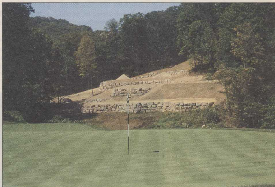
Limestone boulders formed walls and served as the foundation for tees and greens at aptly named Olde Stonewall Golf Club outside Pittsburgh. This shot of the par-3 15th hole looks back from the green at four sets of tees in the background.