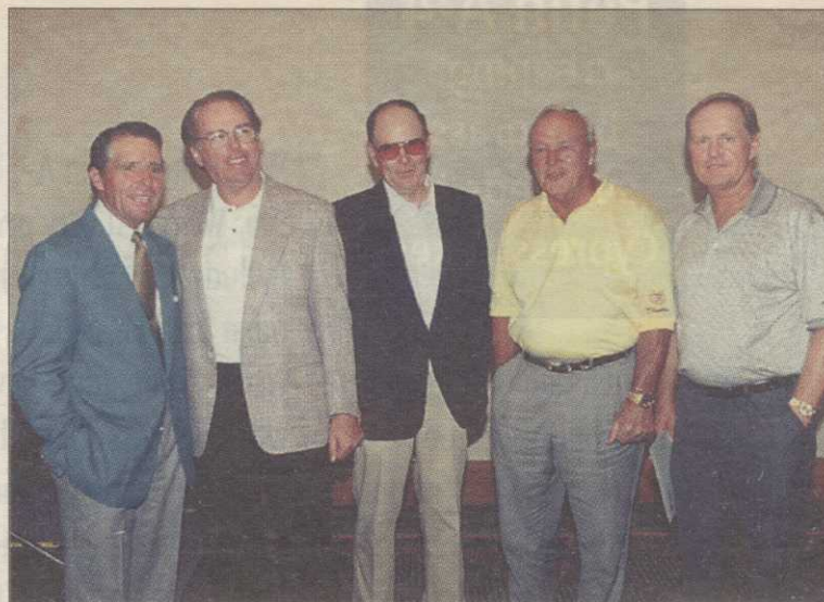
Maybe a first: Gary Player, Tom Fazio, Pete Dye, Arnold Palmer and Jack Nicklaus all in one room at the same time for the project announcement in Palm Beach Gardens.