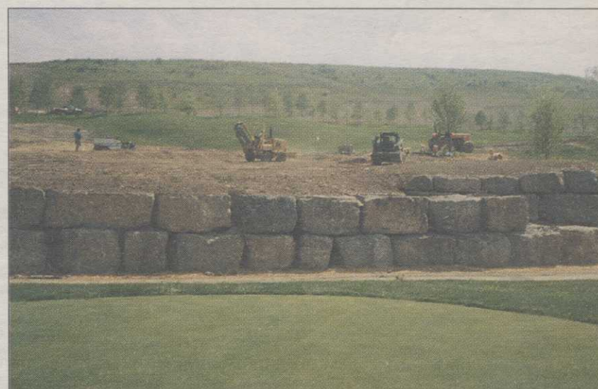
HURDZAN/FRY: LIKE A ROLLING STONE

Heavy machinery is dwarfed by the boulder work at Olde Stonewall Golf Club outside Pittsburgh. The clubhouse and maintenance building bring the British countryside to mind. See story page 27.