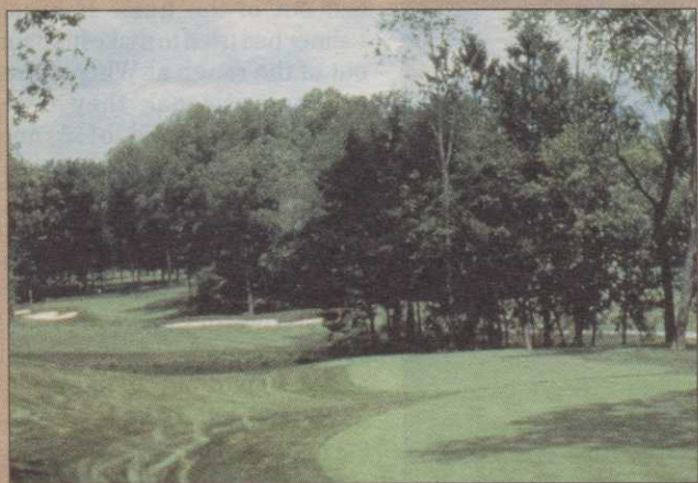
Seed supplied by United Horticultural Supply

Leading superintendents rate Providence the best creeping bentgrass for the northern U.S. and Canada.