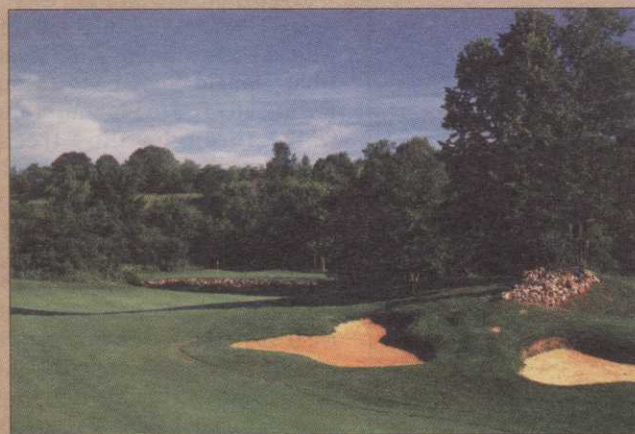
Seed supplied by L.L. Olds Seed Co.

"Providence has performed as expected; with its upright growth characteristics, fine leaf texture, uniform density and color, it has truly been a winner for us. Since the day we opened, our customers have loved the consistency and smoothness of our putting surfaces."