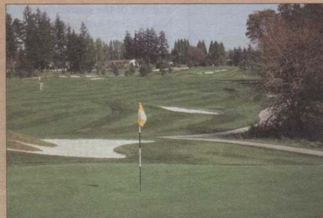
Seed supplied by Professional Turf Center

"This is my fifth grow in and my first with pure Providence greens. It's a very fine, upright turf. Slightly slower to establish because of our cold and rainy fall, but now that we are maturing it's showing its true colors to be a great putting surface."