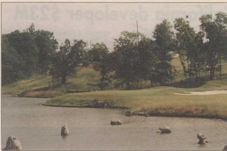
The 11th hole at Mark McCumber-designed GreyStone in Dickson, Tenn., is a 177-yard par-3 over water.

Stone to showcase Middle Tennessee's natural beauty. "Our school of thought in course design is to study the land and design a course that is natural, looks like it belongs, create interest and surprise where pos-