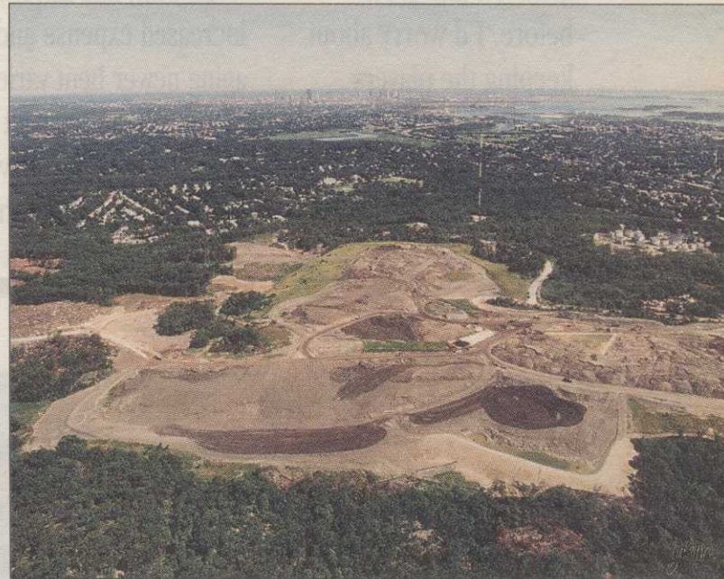
An aerial shot of the Quarry Hills site and the Boston skyline in the distance.