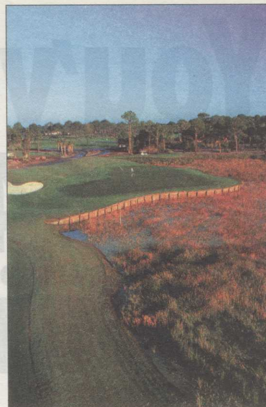
The Indian River Club: an environmental winner