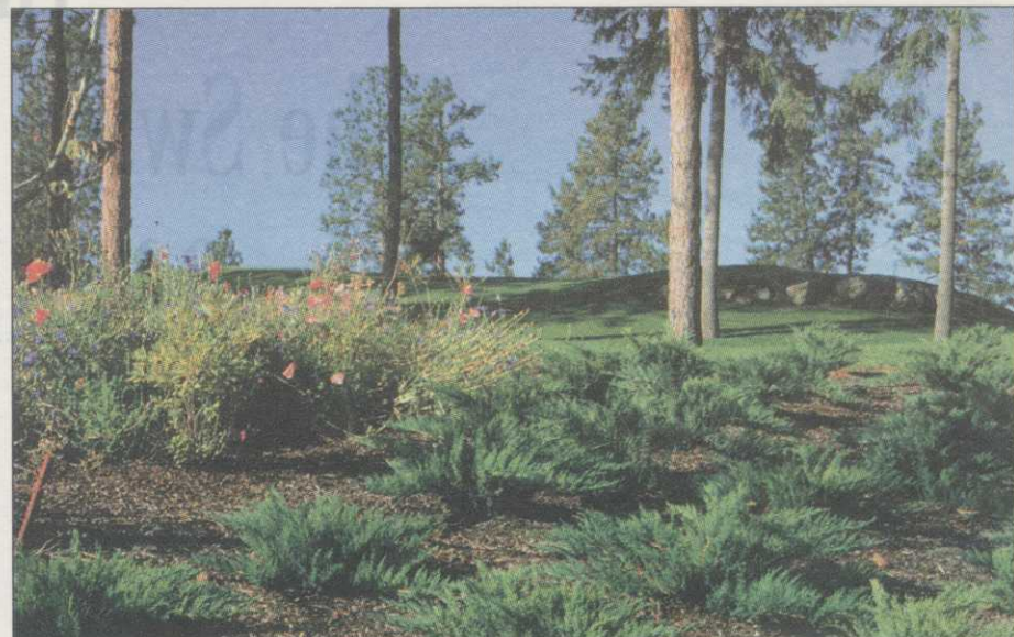
Coeur d'Alene has made beauty an asset of great proportions.