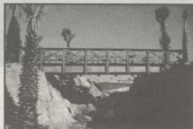
The Macho Combo: Combines the beauty of wood and the strength of maintenance free self-weathering steel. Bridge designed by Golf Dimensions.

Specializing in golf course/ park/ bike trail bridges and using a variety of materials to suit your particular landscape needs, we fabricate easy-to-install, pre-engineered spans and deliver them anywhere in North America.