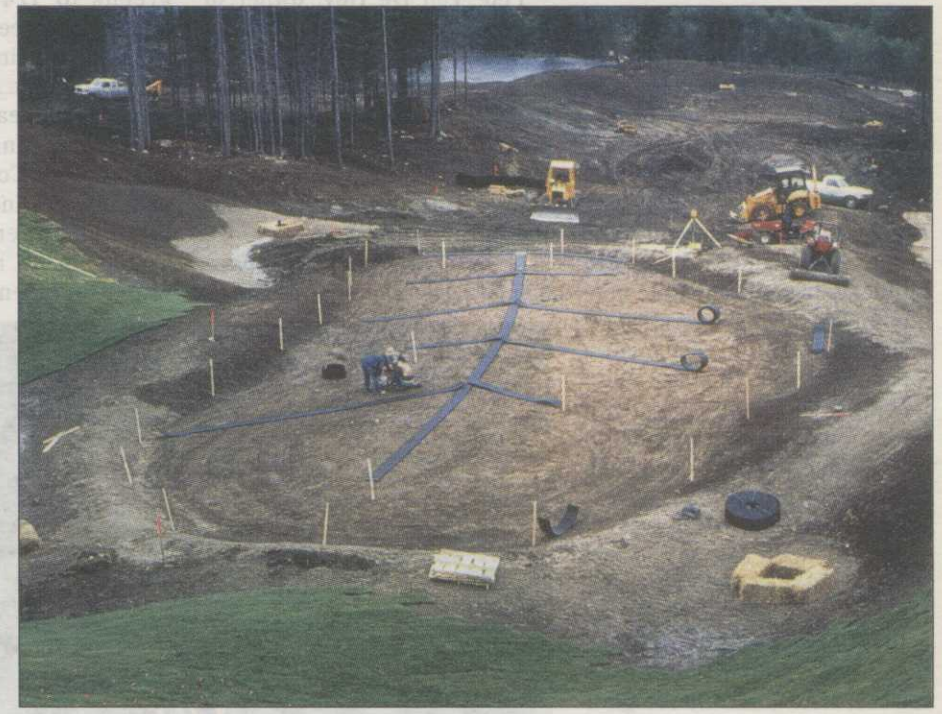
One of the earlier Hurdzan-Fry greens showing ADS AdvanEDGE pipe installed horizontally on the sub-base.