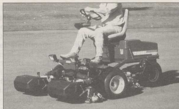
Ransomes' E-Plex II offers three new enhancements.