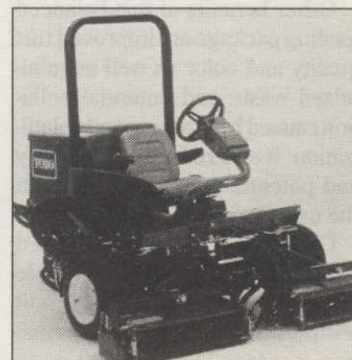
Toro's new Reelmaster

powder formulation are low-odor in addition to being high-power. DYLOX. When you need it, you really need it. Isn't it nice to know it's there if you do? To find out more, contact Bayer Corporation, Garden & Professional Care, Box 4913, Kansas City, MO 64120. (800) 842-8020. http://usagri.bayer.com