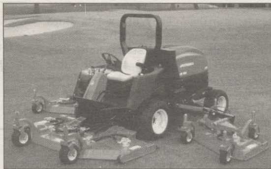
Jacobsen's HR-9016 Turbo