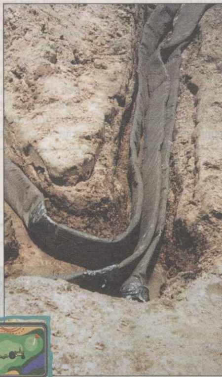
Siphon drainage 8-by-1-inch pipe is installed vertically in the trench.