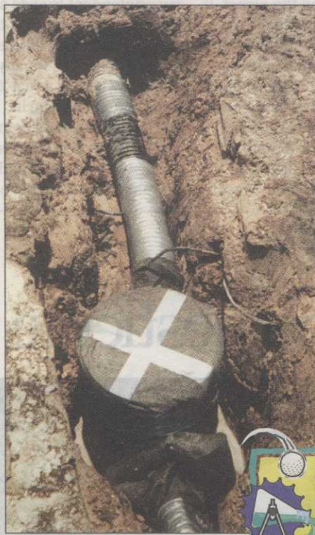
"X" marks the spot where the drainage grate is covered with a geotextile filter cloth.

Quinn has experimented and is currently testing this system in a greenside bunker, where crews have installed the plastic pipe covered with a geotextile cloth.