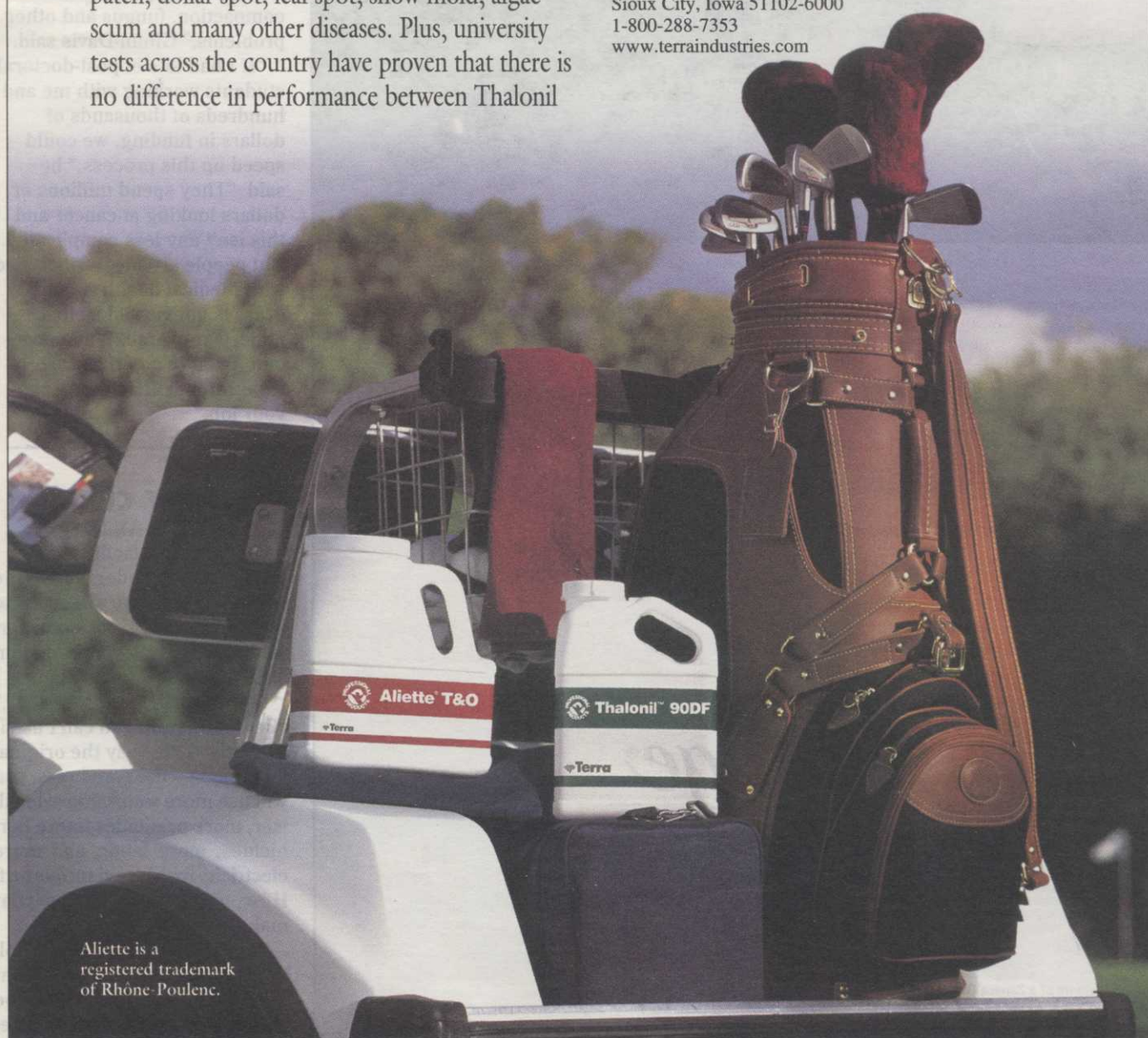
Aliette is a registered trademark of Rhône-Poulenc.

Terra Industries Inc. P.O. Box 6000 Sioux City, Iowa 51102-6000 1-800-288-7353 www.terraindustries.com