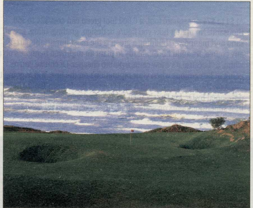
GOLF AHOY: The first 18 holes of Bandon Dunes in Bandon, Ore., a 54-hole, 2,000-acre development, will open for play in June of 1999. The 7,253-yard, par-72 oceanside layout was designed by Scot David Mclay Kidd. The 12th green is pictured above. See page 61.