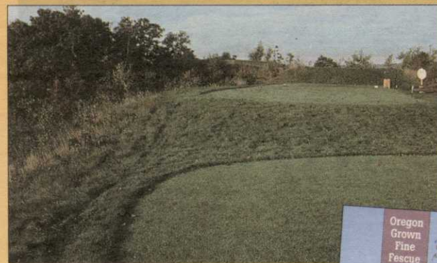
Widow's Walk GC, Massachusetts