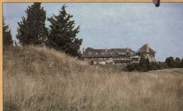
The Misquamicut Club, Rhode Island

So, no matter where you use it or how you cut it, fine fescue is making history — again!