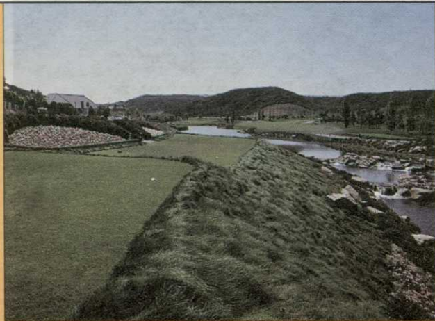
Del Mar CC, California