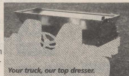
Your truck, our top dresser.

your truck's high maneuverability speeds top dressing around tight areas and greens. Let us show you how.