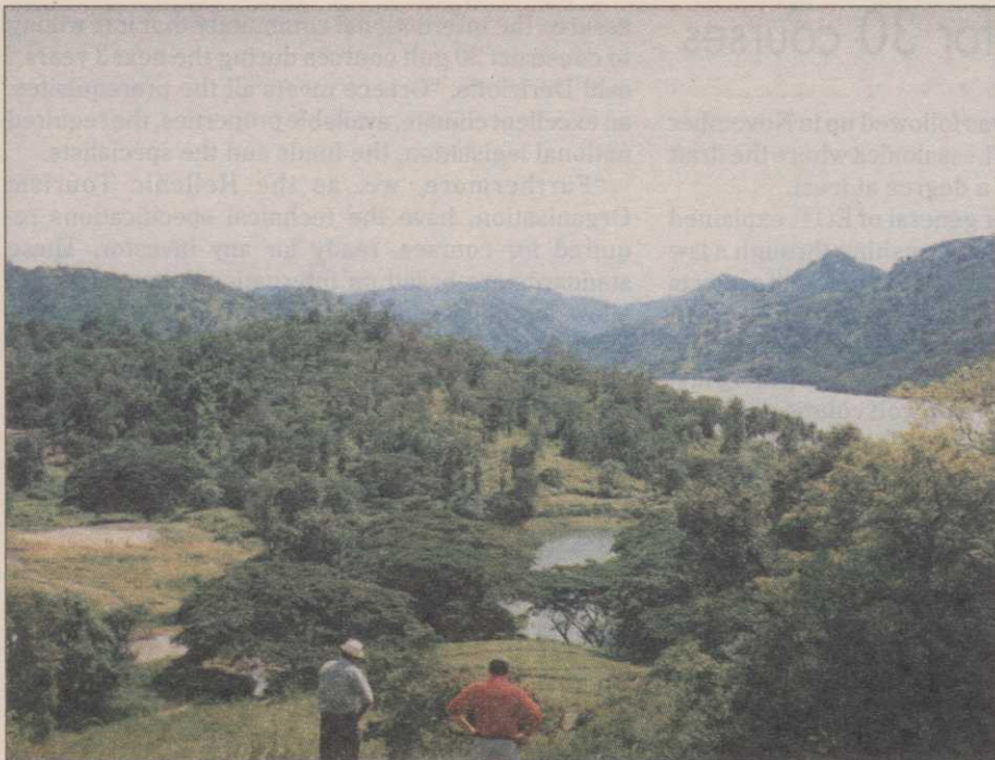
The view from the proposed 7th tee at The Victoria Golf and Country Club Resort course near Kandy, Sri Lanka.