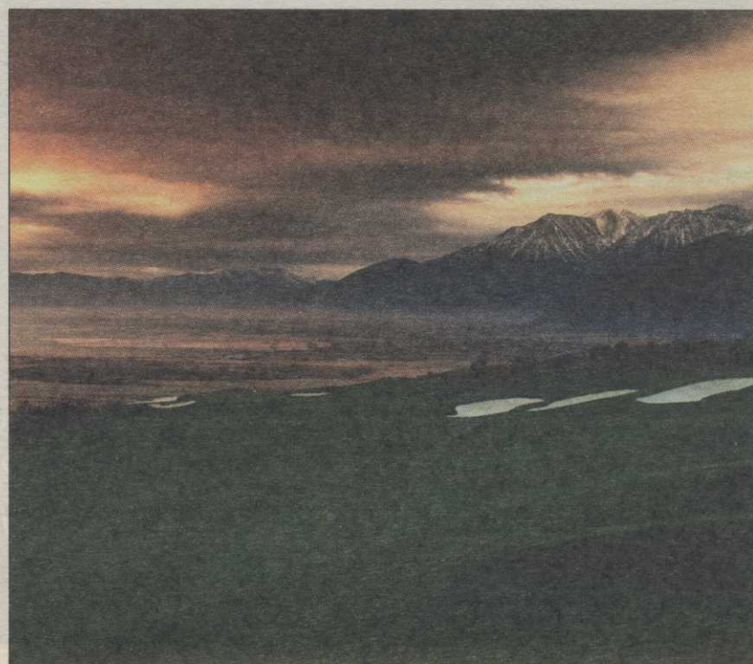
American Golf Corp.'s Sierra Nevada Golf Club in Genoa, Nev., to open this month. See page 3.