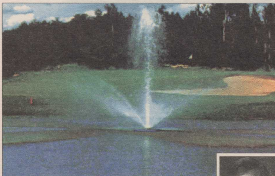
The 8th hole at Cedarbrook Golf & Country Club.