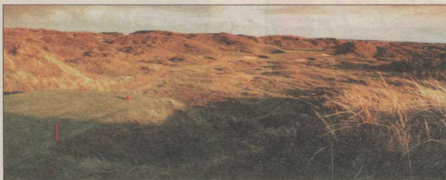
1998 British Open venue Royal Birkdale has undergone five years of renovation.

From 2 to 6 inches deep, the soil was anaerobic, dense, contained too fine a particle size, had a plastic consistency and was too rich in humus.