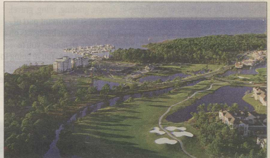
Aerial view of Florida's Sandestin Resorts course.