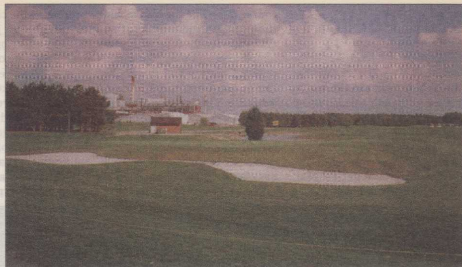
DuPont's manufacturing plant is visible in the background on the Seaford Golf and Country Club's par-4, 400-yard 3rd hole.