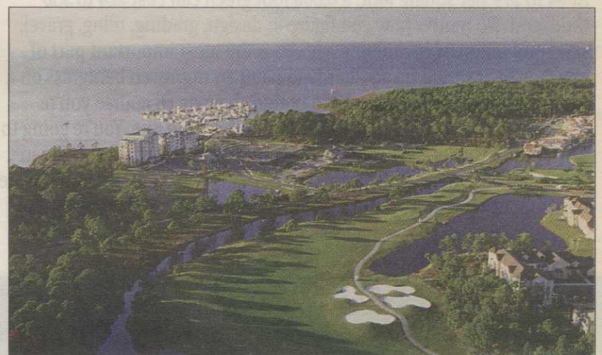
Aerial view of Florida's Sandestin Resorts course.