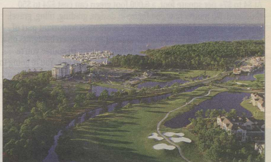
Aerial view of Florida's Sandestin Resorts course.