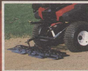
EXCLUSIVE, PATENTED "SPEED BOSS" AUTOMATICALLY LIMITS FINISH SPEED

The new and most advanced sand maintenance system, bringing superiority in ergonomics, finish and bunker play.