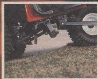
EXCLUSIVE, HIGH 9-INCH CLEARANCE FOR EASY BUNKER ACCESS AND EXIT