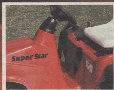
EXCLUSIVE "STEP-THROUGH" CHASSIS AND TILT WHEEL FOR OPERATOR COMFORT