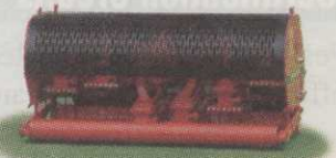
Verti-Drain Greens Model 7316, just one of nearly a dozen models available to fit virtually every budget.

To really see the dynamic action of the Verti-Drain phone now for our information packet including our new, free video.