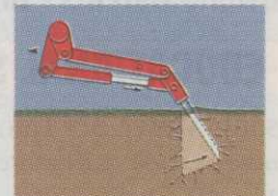
Verti-Drain's patented parallelogram design shatters the soil. Coring tines are also available on all models.