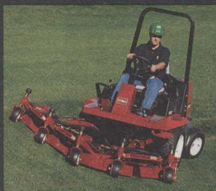
The New Contour 82 Deck mows undulations traditional rotary mowers can't.

A golf course with a rolling landscape is a beautiful thing to see but scalping can make parts of it look like a boot camp haircut. That's why Toro designed the new Contour™ 82 deck for the Groundsmaster® 3000 tractor. Four individual cutting chambers with 22 inch blades articulate independently up to 20 degrees and cut down to 1 inch. Without the fear of scalping you'll be able to go places you couldn't go before, so you'll get the job done faster. For a product demonstration call your Toro distributor: 1-800-803-8676, Ext. 152.