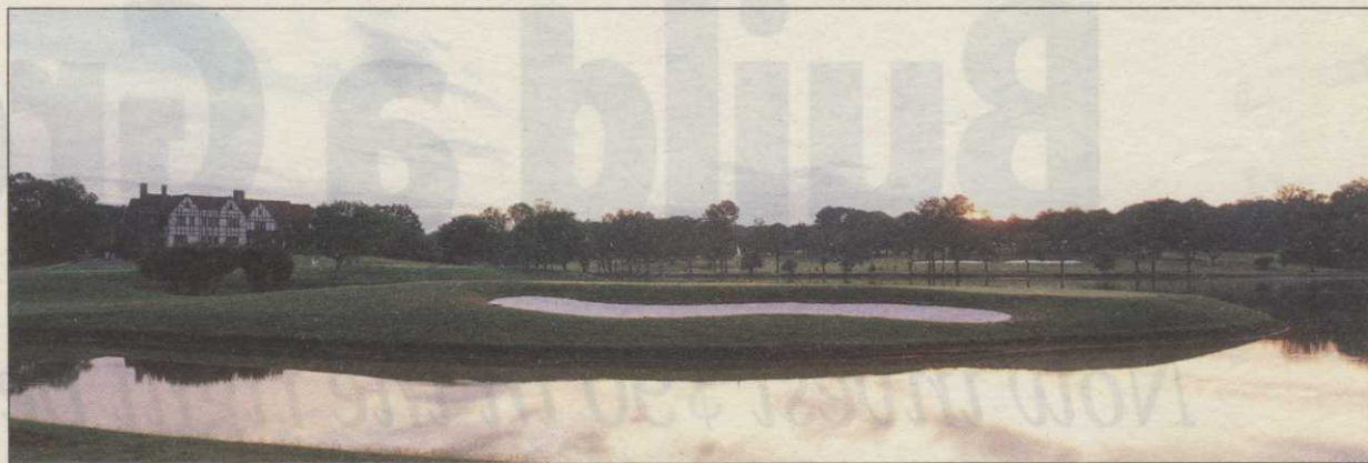
The newly renovated 6th hole at East Lake Golf Club will play host to one of Atlanta's most ambitious junior golf initiatives to date.