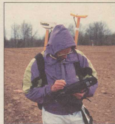
Gathering data by GPS and GSI.