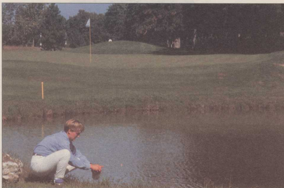
A water sample is taken at TPC River Highlands in Cromwell, Conn.