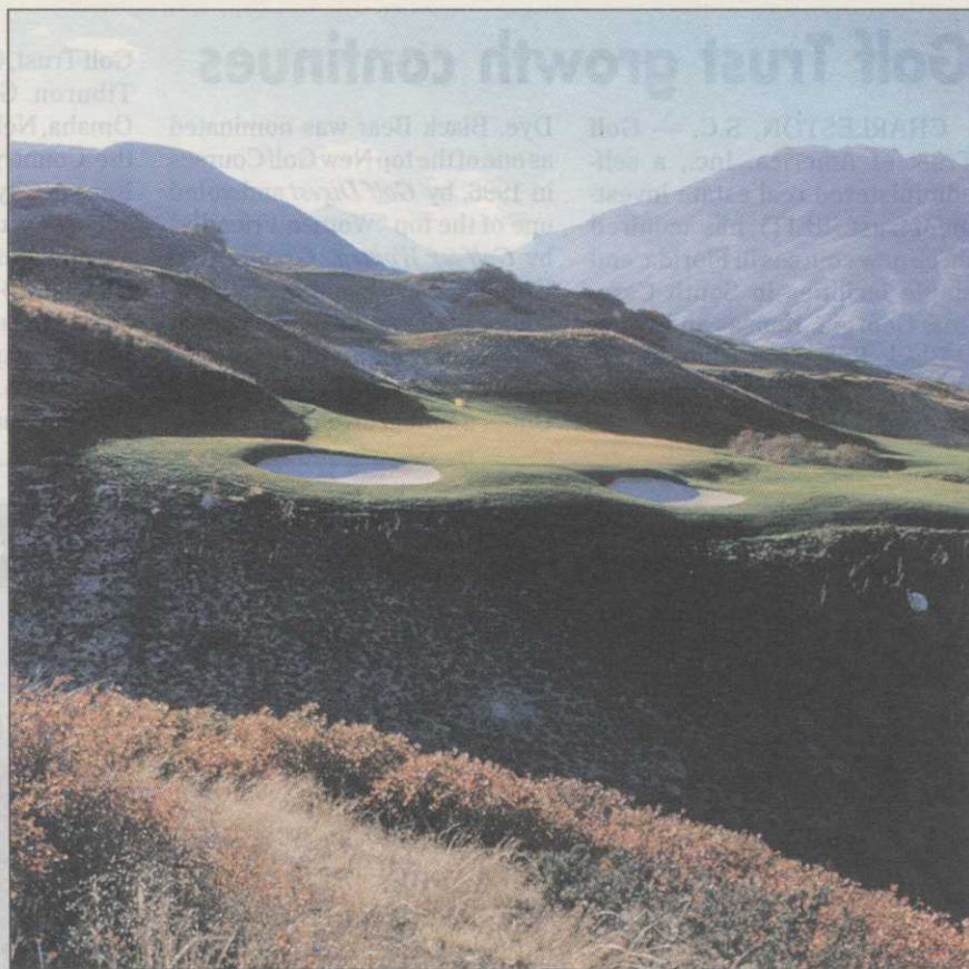
South Mountain GC in Draper, Utah, is a new Crown Golf property coming on line this spring.