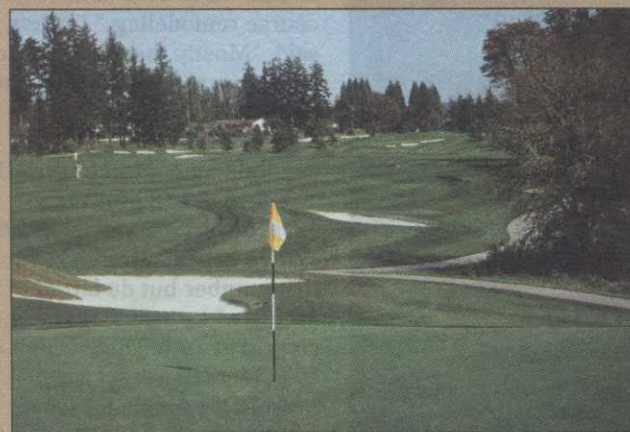
Seed supplied by Professional Turf Center

"This is my fifth grow in and my first with pure Providence greens. It's a very fine, upright turf. Slightly slower to establish because of our cold and rainy fall, but now that we are maturing it's showing its true colors to be a great putting surface."