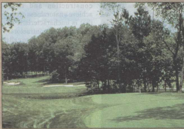
Seed supplied by United Horticultural Supply

Leading superintendents rate Providence the best creeping bentgrass for the northern U.S. and Canada.