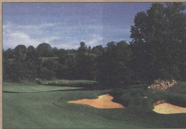
Seed supplied by L.L. Olds Seed Co.