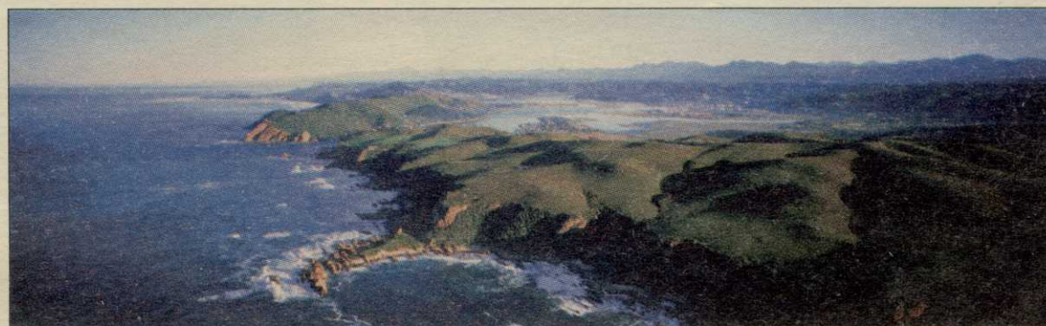
PHOTO OF THE YEAR: Golfplan will design 18 holes here at the Sparreboosch Clifftop Estate in Knysna, South Africa.