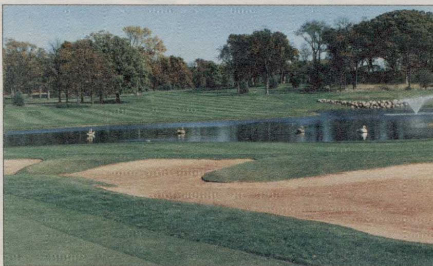
Certainly not your average backyard: the 2nd hole at Rich Harvest.