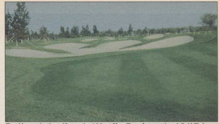
Trouble awaits the golfer on the 16th at Hua Tang International Golf Club

Outsource your golf course maintenance to IGM.