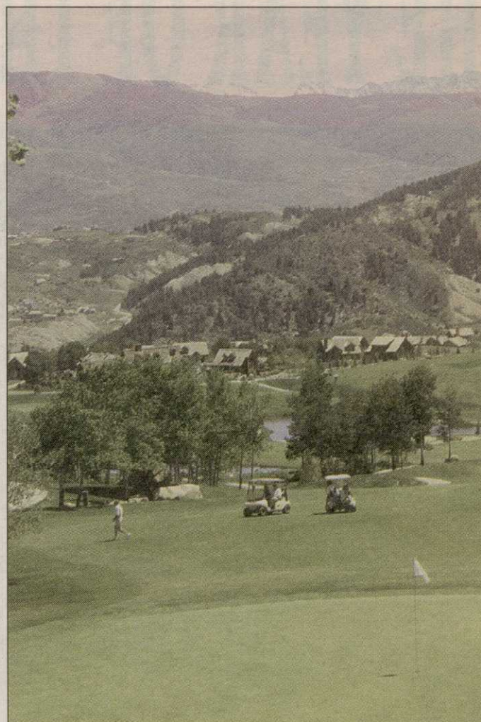
Cordillera Resort outside Vail.