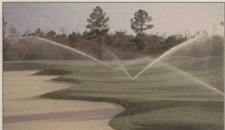
Overlooking irrigation performance is an invitation for disaster in today's competitive world of golf.