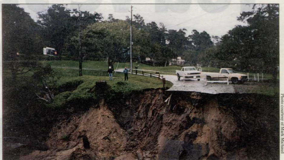
Access to the 15th tee at Pebble Beach Golf Links is destroyed as a result of the El Niño-driven storms in early February.

The winter's intense El Niño-driven storms have hammered California golf courses, highlighted in early February when a series of weather-related records were broken. Several areas of the state recorded the lowest barometer readings ever in February.