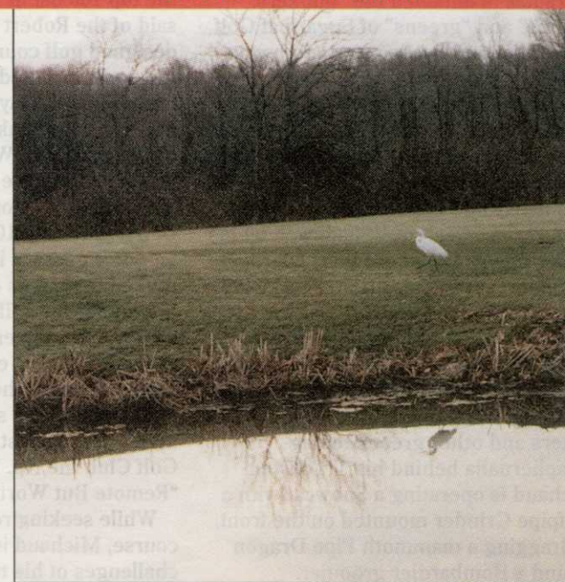
Aspetuck Valley Country Club in Weston, Conn., is home to alltypes of birds, waterfowl and other creatures.