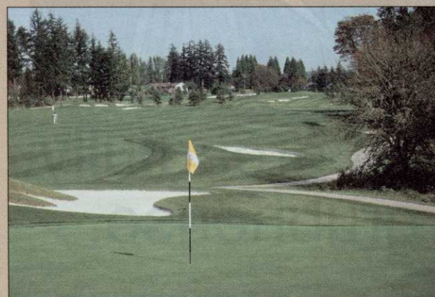
Seed supplied by Professional Turf Center

"This is my fifth grow in and my first with pure Providence greens. It's a very fine, upright turf. Slightly slower to establish because of our cold and rainy fall, but now that we are maturing it's showing its true colors to be a great putting surface."