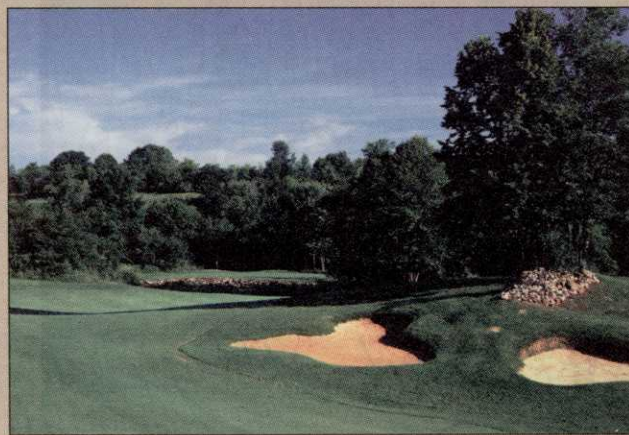
Seed supplied by L.L. Olds Seed Co.