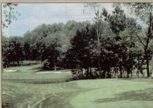
Seed supplied by United Horticultural Supply

Leading superintendents rate Providence the best creeping bentgrass for the northern U.S. and Canada.