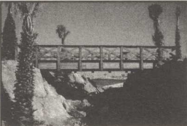
The Macho Combo: Combines the beauty of wood and the strength of maintenance free self-weathering steel. Bridge designed by Golf Dimensions.

Specializing in golf course/ park/ bike trail bridges and using a variety of materials to suit your particular landscape needs, we fabricate easy-to-install, pre-engineered spans and deliver them anywhere in North America.