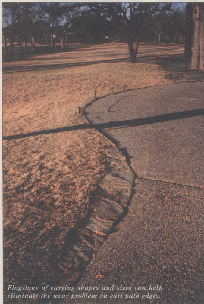
Flagstone of varying shapes and sizes can help eliminate the wear problem on cart path edges.