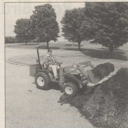
John Deere's 4100