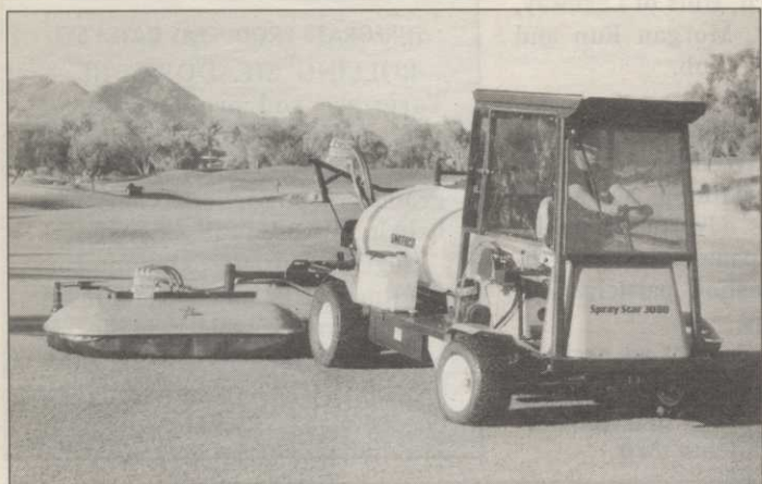
Smithco's Spray Star 3000