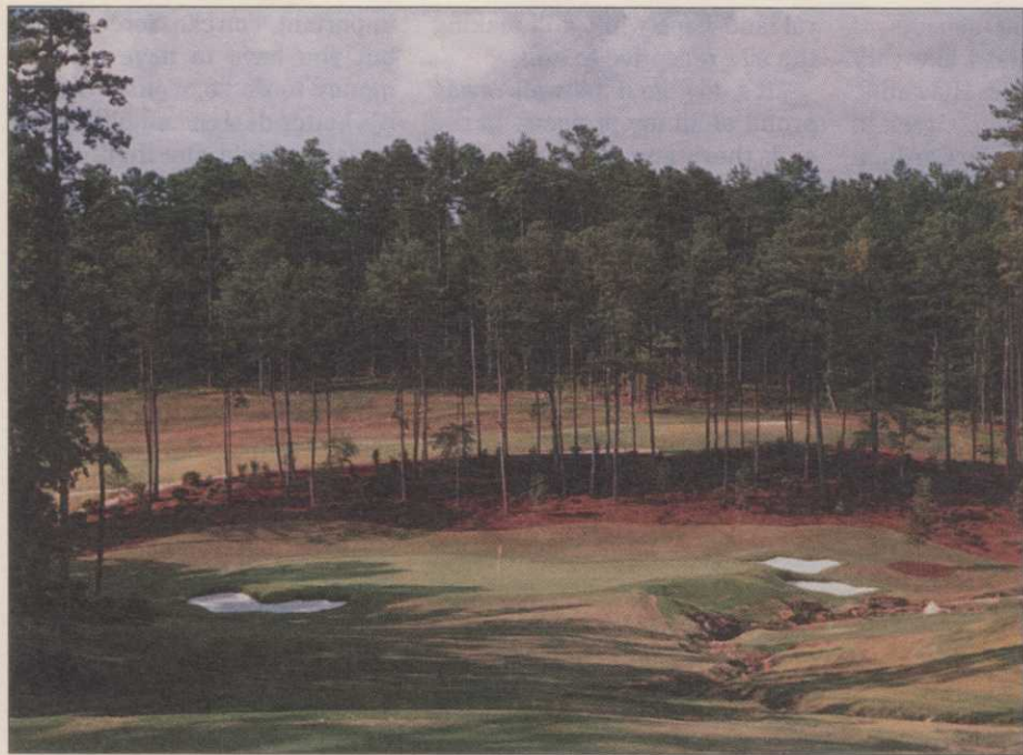
Mature trees characterize the new Reynolds National course at Reynolds Plantation.