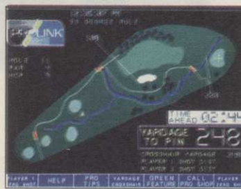
Prolink's onscreen yardage feature