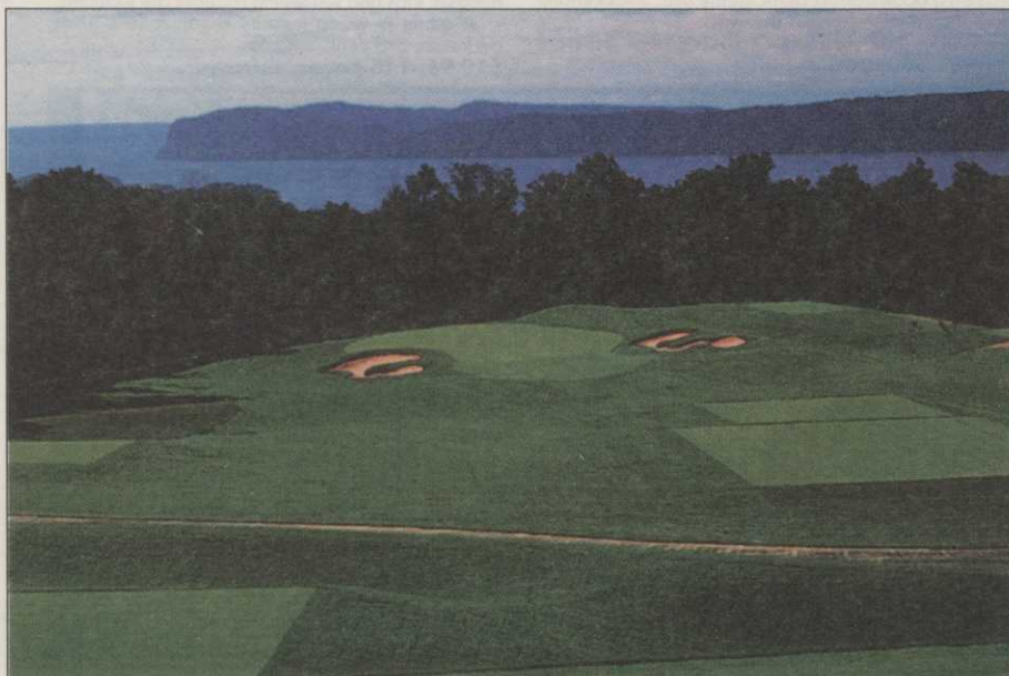
National Fairways has been known for its show stoppers. Pictured above is #16 at Hudson National Golf Club in Croton-on-Hudson, New York.

RDC plans to add three to five golf facilities per year on the East Coast.