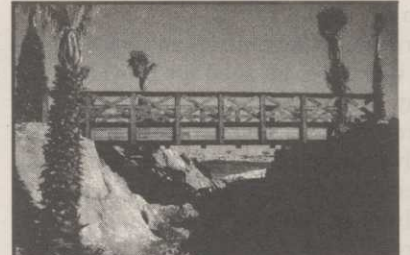
The Macho Combo: Combines the beauty of wood and the strength of maintenance free self-weathering steel. Bridge designed by Golf Dimensions.

Specializing in golf course/ park/ bike trail bridges and using a variety of materials to suit your particular landscape needs, we fabricate easy-to-install, pre-engineered spans and deliver them anywhere in North America.