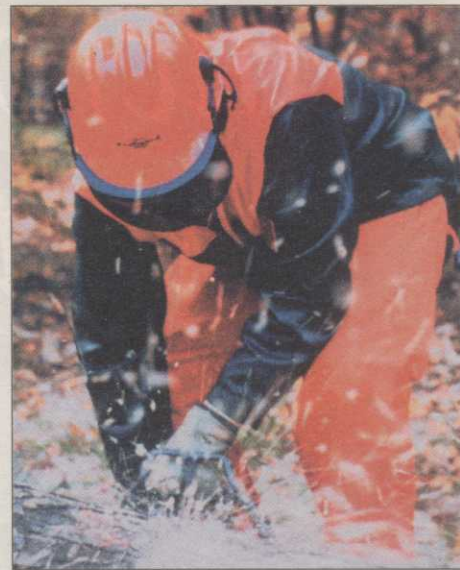
SAFETY BY DESIGN