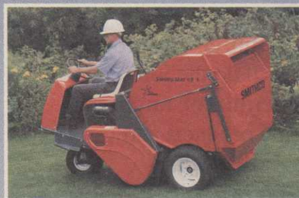
SWEEP STAR 48 New All Purpose Clean-Up