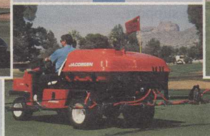
7943 SPRAYER Just For The Jacobsen SV's

ALWAYS OUT FRONT SMITHCO WAYNE, PENNSYLVANIA 19087