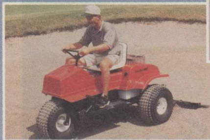
SAND STAR 48V New Maximum Power Electric