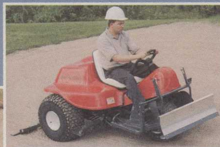
SUPREME New Supremacy In Bunker Care