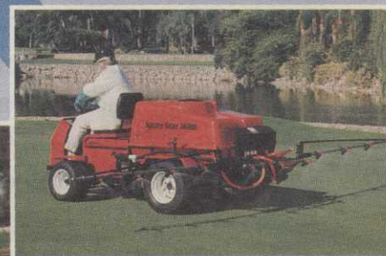
SPRAY STAR 1600 Ultra-Low For High Visibility