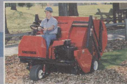
SWEEP STAR 60 For That One Big Clean Sweep