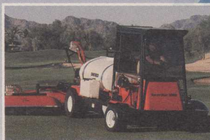
SPRAY STAR 3000 Now With TeeJet® Controls