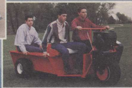
RED RIDER Known For Its Top Dependability