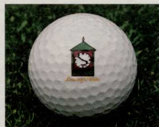
Lassing Pointe Golf Course Union, KY