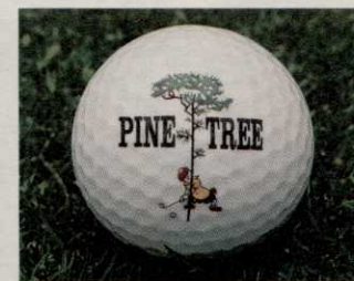
Pine Tree Golf Club Boynton Beach, FL