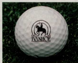
Ivanhoe Club Ivanhoe, IL