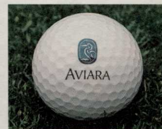
Four Seasons Resort Aviara Carlsbad, CA