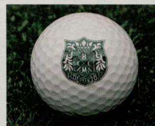
Bryn Mawr Country Club Lincolnwood, IL