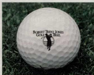
Grand National Auburn/Opelika, AL

The Rock Hill area is currently home to the private, 18-hole Rock Hill Country Club, the 18-hole daily-fee Carolina Downs (opened in 1985), and the new 18-hole Waterford Golf Club.