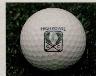
High Pointe Golf Club Williamsburg, MI

A golf course's biggest asset is its grass. Fast greens, luxurious fairways, and thick roughs leave lasting impressions with every golfer.