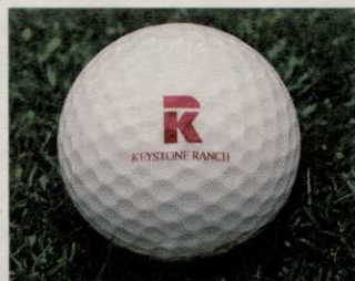
Keystone Ranch Golf Course Keystone Resort, CO