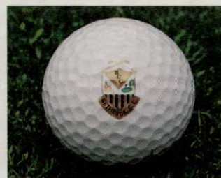
Bethesda Country Club Bethesda, MD