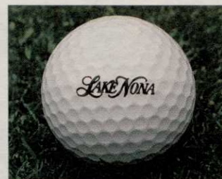
Lake Nona Club Orlando, FL