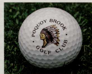
Poquoy Brook Golf Club Lakeville, MA