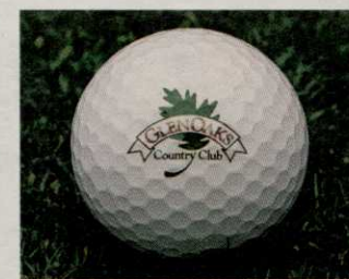
Glen Oaks Country Club West Des Moines, IA