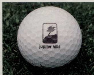
Jupiter Hills Club Jupiter, FL