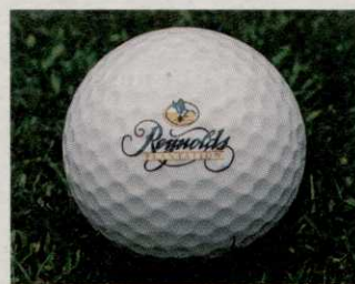
Reynolds Plantation Greensboro, GA