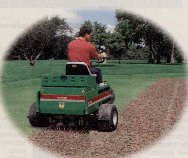
GA™ 30 —A combination of variable core spacing, speed and precision coring. Aerates greens, tees and fairways up to a depth of 3.75 inches.