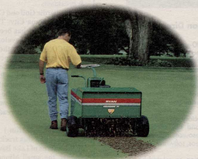
GREENSAIRE® 24 —Developed for greens and other fine turf areas, it pulls 100,000 more cores on 10,000 square feet than the competition, making it the ultimate in greens aeration.

Watering less would be great, but it's not going to happen. You're not going to go back to dry, baked-out bluegrass fairways. You've got bentgrass, and bentgrass has to be watered thoroughly and treated with soil medicines that have to be watered in.