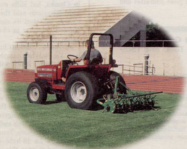
TRACAIRE® —Mount the Tracaire on any tractor with a category "1" 3-point hitch. Cover a 6-foot aerating width with coring, slicing or deep spoon tines.