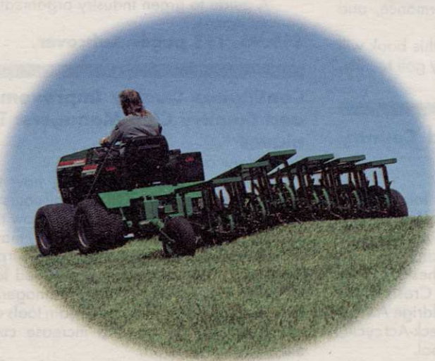
RENOVAIRE® —Designed with the "true contour" principle in mind, each pair of tine wheels is independently mounted to follow the contour of the land.