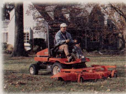
Visibility and maneuverability will increase your productivity.

These 4WD mowers include many technological breakthroughs for increased turf performance. The Auto Assist 4WD with Dual-Acting-Overrunning clutch system delivers turf saving traction. In forward and reverse. It automatically transfers power to all 4 wheels when you need it. So, when the going gets tough, you get traction and reduced turf damage instead of wheel spinning. Or, you can choose to engage 4WD on-the-go.